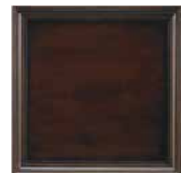
20: Maison (H) A rich hand-rubbed waxed dark walnut high sheen finish enhanced with hand-burnished edges, cow tailing, and a light antique spatter.