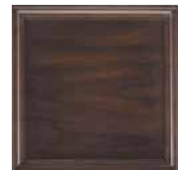
A1: Modern Walnut (H) A rich, warm, high-sheen brown finish that emphasizes the clarity and natural beauty of the wood.