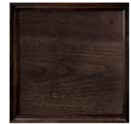
T2: Westwood (M) A beautiful hand-applied ebony wiping stain that allows the beauty of the wood species to show through.