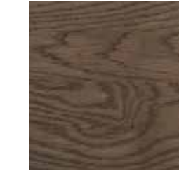
U2: Medium Oak