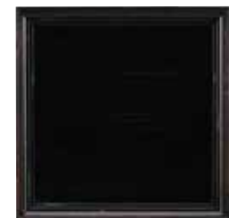
44: Ebony (M) A rich rubbed-through black finish that highlights the underlying wood tones with a lustrous satin-like patina.