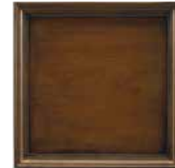
10: Beeswax(H) A medium brown high sheen finish with hand-applied burnishing and a deep luster.