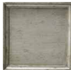
E5: French Blue (L) Aged like a fine vintage Court piece, this is a beautiful grey-blue paint with hints of silver, dry brushing, and glazing.