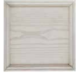
R5: Gardenia White (M) A soft alabaster tone with subtle graining to accent the natural beauty of the wood.