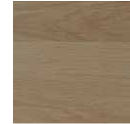
U1: Light Oak

REVIVAL 81 comes in three conventional, but distinct finishes: Light Oak, Medium Oak, and Dark Oak. It can also be finished in any of Hickory White's renowned custom finishes that are compatible with oak or ash hardwood solids and veneers.