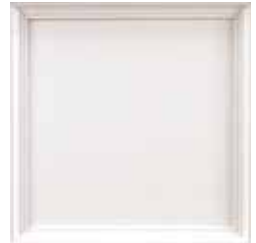
27: Sugar (L) An opaque, clean white finish with a very slight intermittent rub-through along the perimeter edge.