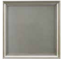
O3: Platinum (M) Platinum is a metallic finish with an underlying base of silver and subtle hand-padded gold overtones, giving a platinum patina.