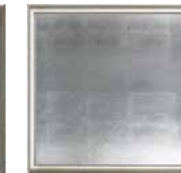
SS: Silver Leaf Squares Painstakingly applied by hand in a grid pattern with very subtle black highlighting.