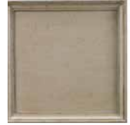
21: Dove (L) A soft patinated Belgian grey finish, burnished and detailed with a gently spattered antique glaze.