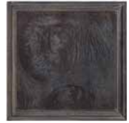
P9: India Ink (H) Dyed navy teal hues that are hand rubbed to enhance the natural beauty of the veneer.