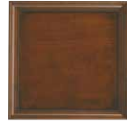
42: Cognac (H) Rich medium brown earth tones accentuate this high-sheen finish with depth and satiny sheen.