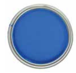
CM: Color Match (M) Select any brand name paint color, and we will Color Match it on your order; include name, number, and color chip with the order.