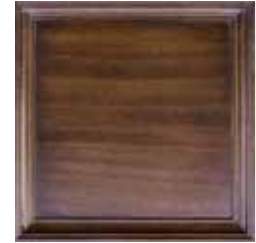
G1: Cotswold (H) A deep clear brown finish with a medium-high sheen level is apt for a formal traditional or urban high-end contemporary look.