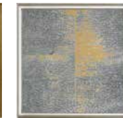
SG: Silver Leaf with Gold Created by applying gold painted ground color, hand-applying silver leaf sheets in a grid pattern, then wearing the edges.