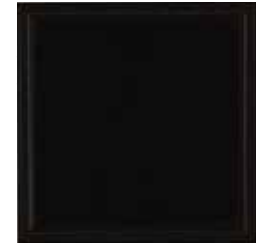
K2: Black(L) A rich and true black finish with a deep luster.