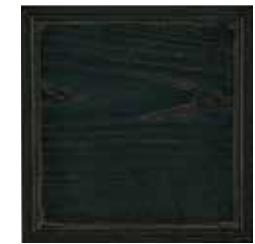
T1: Azure (H) The hand-wiped turquoise blue finish showcases the natural beauty of wood with silver-gold highlights.