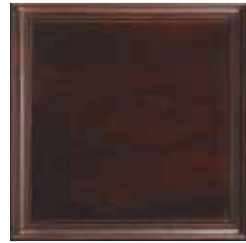
C7: Cashmere (H) The warmth and elegance of this high-sheen dark walnut finish adds a touch of class and refinement to any item.