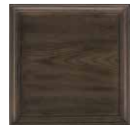
A2: Modern Elm (M) Developed to take advantage of elm veneer grain patterns, this warm greyish-brown high sheen creates a soft, transitional look.