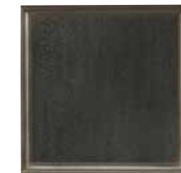
BZ: Bronze Patina Bronze Patina is an organic, variegated finish comprised of browns and greys reflecting an acid-washed surface.