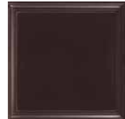
C8: Café Noir (H) The color of rich, dark Colombian coffee; a beautifully sleek, dark brown/black finish with a high sheen.