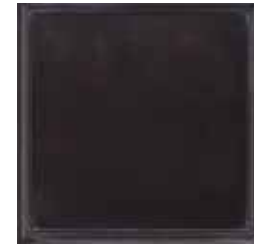
Q1: Black Tie Lacquer (H) A multi-step blending of slightly textured black lacquered tones with subtle sienna undertones.