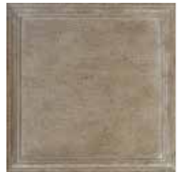
J3: Washed Canvas (L)* Has a white filler intended to hang up in the grain, then sealed, dry-brushed, visually distressed, and finished with three coats of lacquer. *AVAILABLE ON ASH & OAK ITEMS ONLY.