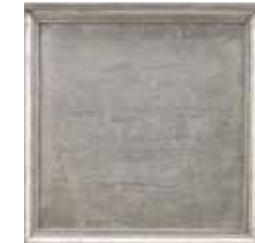
PL: Platinum Leaf (L) A true leafing process, silver leaf sheets are hand applied to the wood frame, cured and glazed over.