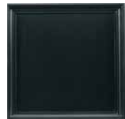
48: Espresso (M) Deep rich black traditional finish with a deep luster that has a very light rub-through along the perimeter edge.