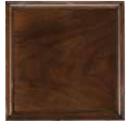
54: Soho (H) A rich, medium-value, clear brown finish reminiscent of a lightly burnished antique pecan with a high sheen level.