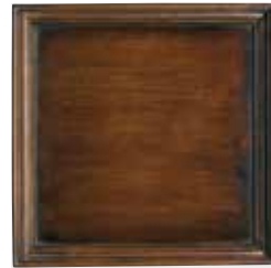
LC: Antique Walnut (M) A rich, clear, and dark brown finish with reddish undertones reminiscent of the color of a dark acorn.