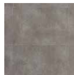
S5: Crystal Grey