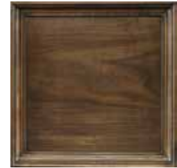
M2: Carob Brown (L) A low sheen and warm brown finish enhances Walnut's beautiful grain and warm tonal ranges.