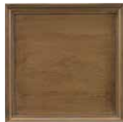
31: Driftwood (L) A neutrally aged pecan-toned finish enhanced with a bleached grey-beige overtone to characterize a weathered antique.