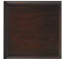
65: Walnut (H) A sophisticated high sheen finished walnut brown with russet undertones enhancing the natural beauty of wood.