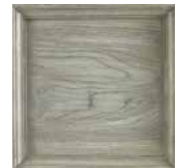
N6: Earth Grey (L) The earth grey finish offers casual light grey hues with a dry antique vintage character.