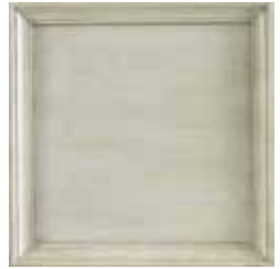
H2: Sancere (L) A warm, creamy ivory painted finish with a very light brush-stroke glaze applied over the top.