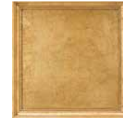
GL: Gold Leaf (L) A true hand-leafed finish, sheets of gold leaf hand-applied, cured, then glazed over.