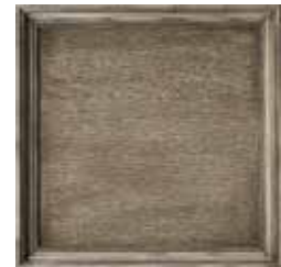
N1: Vintage Grey (M)** Casual semi-opaque grey finish with grain character highlighted through sandblasting. **AVAILABLE ON ASH & OAK SANDBLASTED ITEMS ONLY.