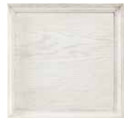
P6: Sandstone (L) Sandstone is a casual lighter hue with a whitewashed canvas effect. The depth of the finish is subtle and crafted with character.