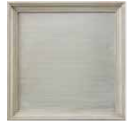
F6: Sea Glass (L) Strie finish generated by a hand brushing technique. Creamy white texture over pale iridescent, seafoam green-cast undertones.