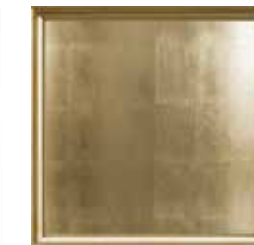
GS: Gold Leaf Squares Painstakingly applied by hand in a grid pattern with very subtle black highlighting.