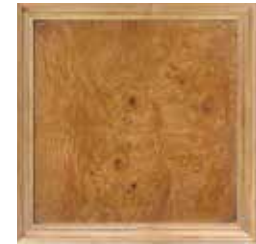
P7: Champagne (H) Mid-tone sophisticated tan hues designed to enhance the character of the veneer. Hand rubbed to create a vintage character.