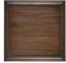
R6: Equestrian Brown (M) A rich espresso finish with subtle highlights. The color provides an aged yet sophisticated look.