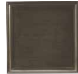
39: Black Nickel (H) A deep nickel-colored paint finish with very fine black brushing on top and a high sheen to resemble black nickel metal.