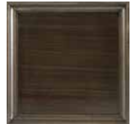
P3: Smoked Walnut (L) Natural clarity of the wood is enhanced with a darkened stain.