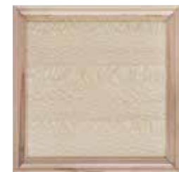
R7: French Pearl (M) French Pearl is a subtle pearlized finish on a highly figured lacewood veneer. *AVAILABLE ON LACEWOOD ITEMS ONLY