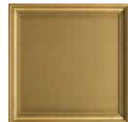
F4: Gold (L) Gold paint with a glazed appearance to emulate the beauty and appearance of gold leafing.