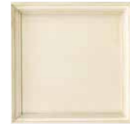
34: Washed Linen (L) Clean, off-white finish with a very light rub through, providing the natural look of washed cotton or flax.