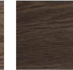
U3: Dark Oak