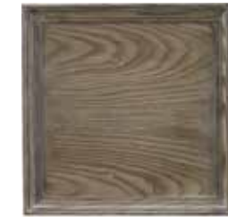
A5: Smoke Ash Sandblasted (L)** Semi-opaque greige finish with sand blasting technique to create wood character. **AVAILABLE ON ASH & OAK SANDBLASTED ITEMS ONLY.