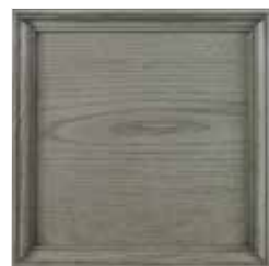
J7: Mineral (L) Grey-stained finish with some translucence which accentuates the wood character of the item.