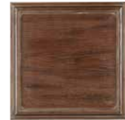
R8: Beretta Brown (L) A rich cocoa brown with toffee highlights and silver/gold hangup.