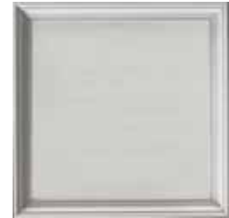
M3: Silver Fox (H) Metallic silver color that is very refined, allowing for translucence to showcase the natural beauty of the wood.