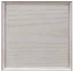
Q6: Wishbone (L) Subtle cerusing in this off-white palette creates a casual, inviting feel.