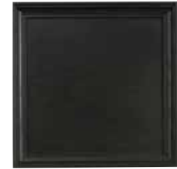
B4: Charbrown (L) With undertones of black that are first applied to fill in the graining, Charbrown is a deep, dark chestnut with a clear view of the wood.