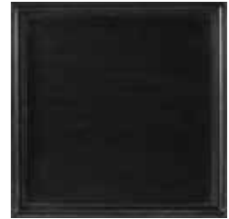
Q7: Midnight (H) A soft patinated Belgian grey finish, burnished and detailed with a gently spattered antique glaze.