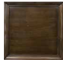
R9: Ember (H) A clear, medium-brown finish with a slight grey undertone enhances the natural beauty of the wood.