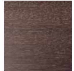
R3: Kona Bean (L) An ebony blackened paint with finely brushed grey metallic accents.