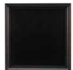
53: Sable (H) A rich dark brown high sheen finish with excellent clarity.