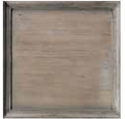
LR: Slate (L) A multi-step finish starting with a medium brown finish, then overlaid with a grey-beige secondary finish.