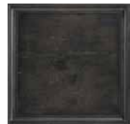
C3: Malabar (M) A wonderfully soft black finish with brown undertones.