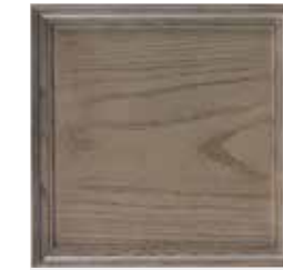
35: Smoked Ash (H) Semi-opaque greige finish.