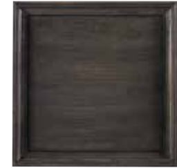
J8: Cinder (L) A clear medium-brown finish with hints of dusky grey beneath the surface provides an almost iridescent effect.