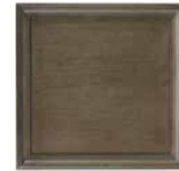
79: Stone (L) Very clean grey-beige finish that reads through to the beauty of the wood grain beneath.